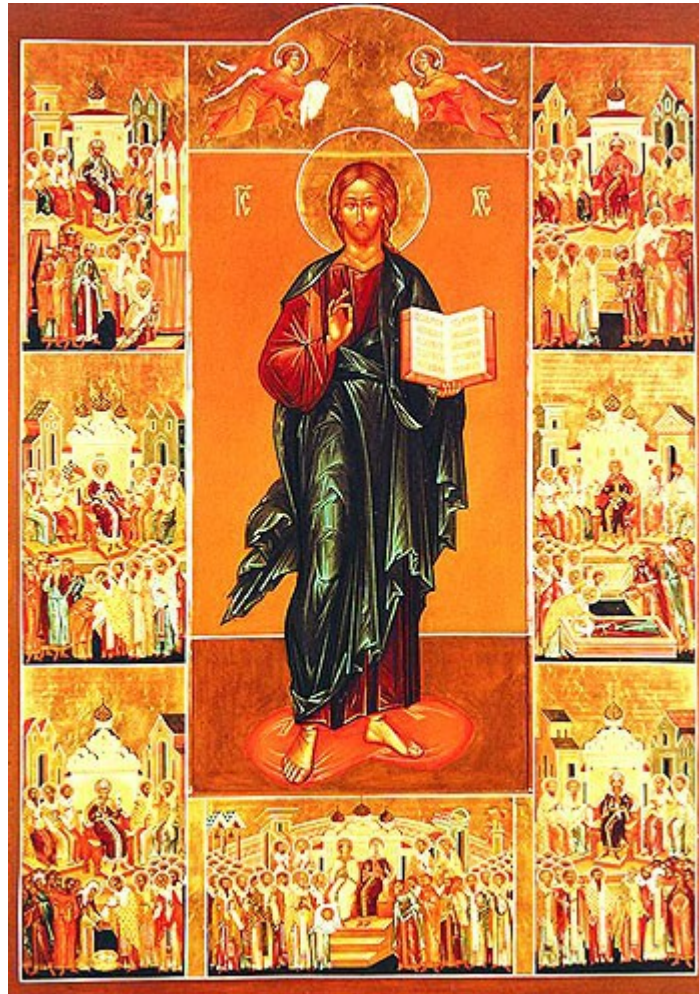
Icon of our Lord Jesus Christ with the Œcumenical Councils